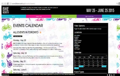
Check out the Bike Month Event Calendar!

Upgrades to cycling infrastructure should be baked into the development approvals process. When sites are up for redevelopment, cycling infrastructure should be upgraded in tandem. While we've begun to see this with bike parking, on street infrastructure upgrades still require advocacy work. Our staff and volunteers worked hard with City staff and elected officials to ensure that the bike lanes on Lower Yonge St are upgraded to protected bike lanes upon redevelopment. A special thanks to Councillor Pam McConnell for moving the motion at City Council!