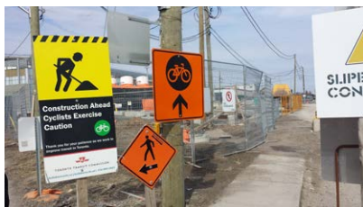
Leslie St construction signage

Want to join our team? WE'RE HIRING! Cycle Toronto is currently hiring four Event Coordinators & and four Operations Coordinators for our summer season! These are part-time, paid positions which will be overseeing the logistics of our events & Bike Valets from April to October. Check out the full job postings on our website for more info! Applications close April 17 at 12pm.