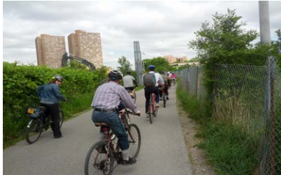
Exploring the West Toronto Rail Path

Spring is upon us and it's the perfect time to start biking to work! Help build a community of cyclists at your workplace by offering one of our Street Smarts Workshops! Learn about safe cycling, how to ride to the office, biking in wet and cold weather, basic and advanced bike maintenance, or how to fix a flat tire. Read more about the 6 workshops we offer on our website .