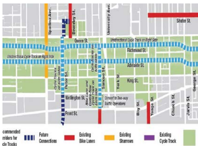
Map of the proposed pilot project infrastructure network