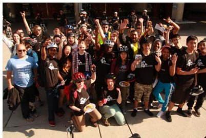
Bike to School Day Group Commute to Nathan Phillips Square!